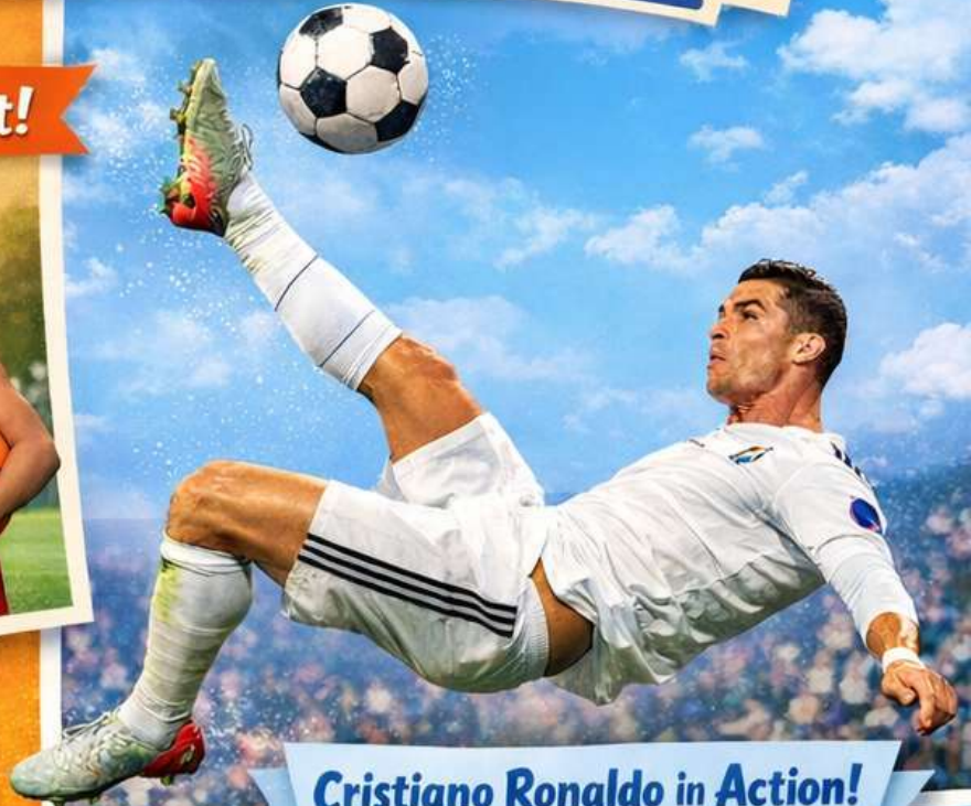
Cristiano Ronaldo in Action!