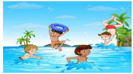
with - brothers