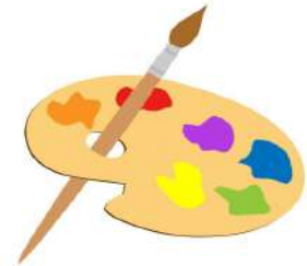
paint - free time