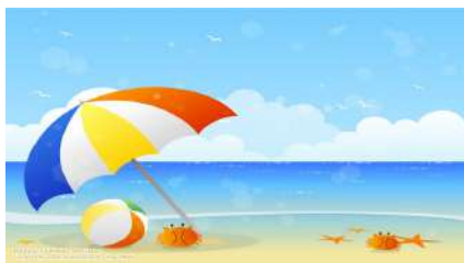
go - beach

Write 3 sentences using guide pictures and words about 'A day on the Beach':