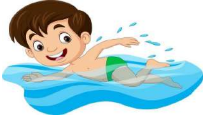
swimming - hobby

Write 3 sentences using guide pictures and words about 'My hobby':