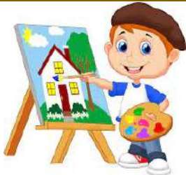
like - painting

Write 3 sentences using guide pictures and words about 'The Artist':