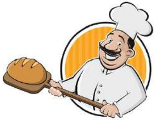
baker - bread

Write 3 sentences using guide pictures and words about 'The Baker':