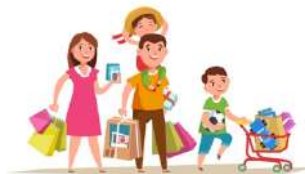
with - family