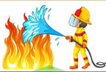
put out - fire