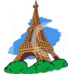
visit - places