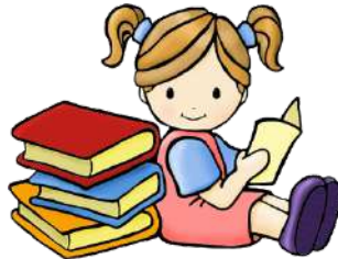
read - stories