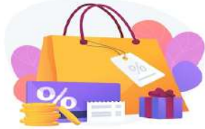
like - shopping

Write 3 sentences using guide pictures and words about 'Shopping' :