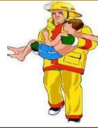
save - people