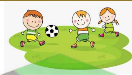
play - friends