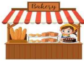
works - bakery