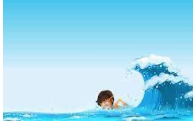
swim - sea