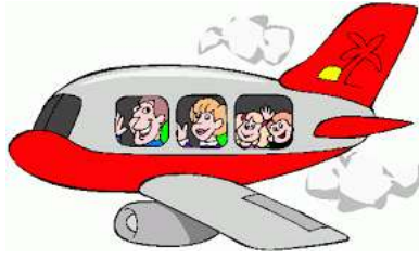
travel - family