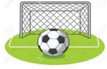
in - club