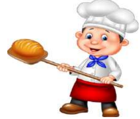
start - early