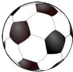
football - sport

Write 3 sentences using guide pictures and words about 'Football':