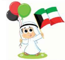
live - Kuwait