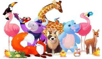
see - animals