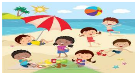
with - friends