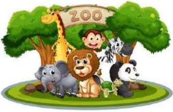
go - zoo

Write 3 sentences using guide pictures and words about 'The Zoo':