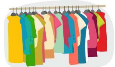
clothes - food