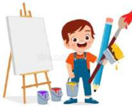
want - artist