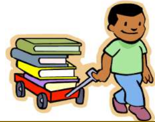
buy - books