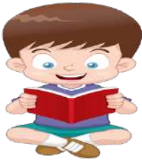
reading - hobby

Write 3 sentences using guide pictures and words about 'Reading':