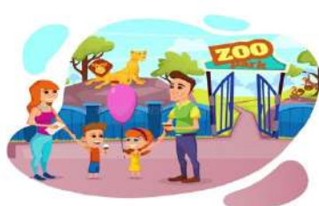
go - family