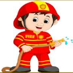
fireman - brave

Write 3 sentences using guide pictures and words about 'The Fireman':