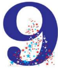
years - old