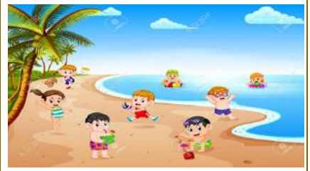
swim - play