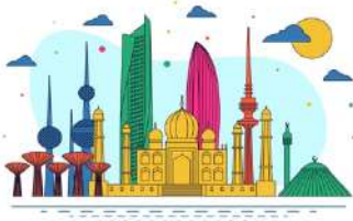
Kuwait - lovely

Write 3 sentences using guide pictures and words about 'Kuwait' :