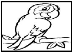
(Polly - parrot)

Write 3 sentences about ( Polly ) with the help of the guide words and pictures :